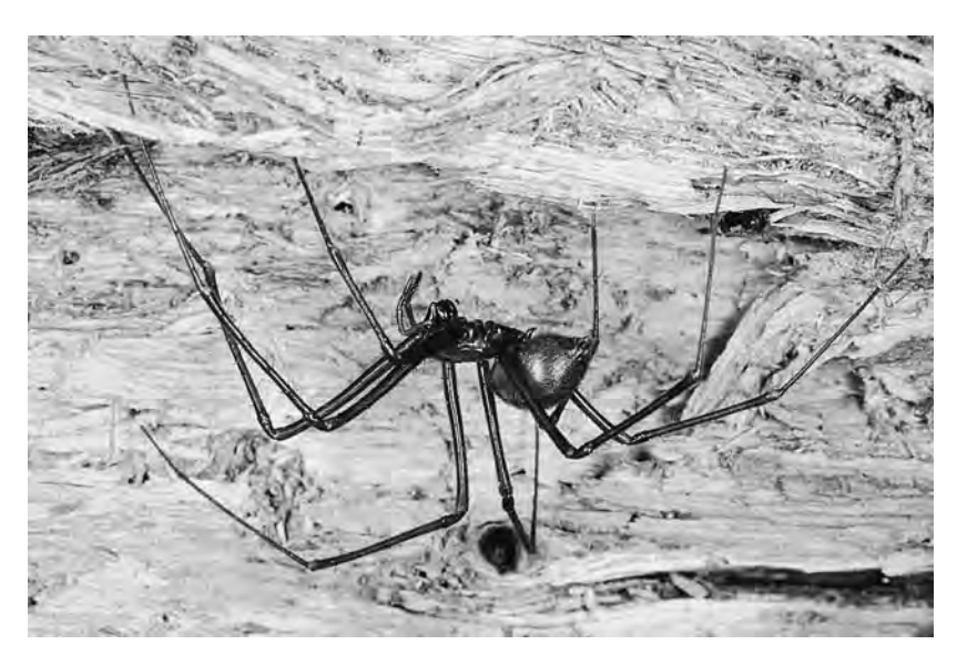
2.1. Pimoa cthulhu.

The tentacular are not disembodied figures; they are cnidarians, spiders, fingery beings like humans and raccoons, squid, jellyfish, neural extravaganzas, fibrous entities, flagellated beings, myofibril braids, matted and felted microbial and fungal tangles, probing creepers, swelling roots, reaching and climbing tendrilled ones. The tentacular are also nets and networks, IT critters, in and out of clouds. Tentacularity is about life lived along lines—and such a wealth of lines—not at points, not in spheres. "The inhabitants of the world, creatures of all kinds, human and non-human, are wayfarers"; generations are like "a series of interlaced trails." String figures all.