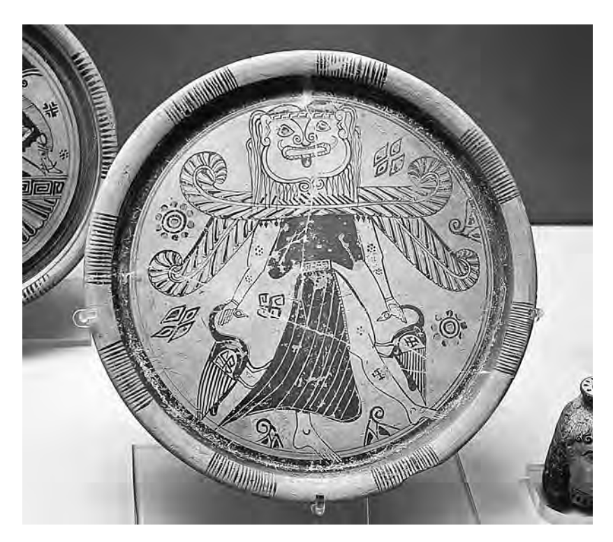
2.6. Icon for the Chthulucene. Potnia Theron with a Gorgon Face. Type of Potnia Theron, Kameiros, Rhodes, circa 600 BCE, terracotta, 13 in. diameter, British Museum, excavated by Auguste Salzmann and Sir Alfred Bilotti; purchased 1860.

ing of much more awe-ful stories and enactments of generation, destruction, and tenacious, ongoing terran finitude. Potnia Theron/Melissa/Medusa give faciality a profound makeover, and that is a blow to modern humanist (including technohumanist) figurations of the forward-looking, sky-gazing Anthropos. Recall that the Greek chthonios means "of, in, or under the earth and the seas"—a rich terran muddle for SF, science fact, science fiction, speculative feminism, and speculative fabulation. The chthonic ones are precisely not sky gods, not a foundation for the Olympiad, not friends to the Anthropocene or Capitalocene, and definitely not finished. The Earthbound can take heart—as well as action.