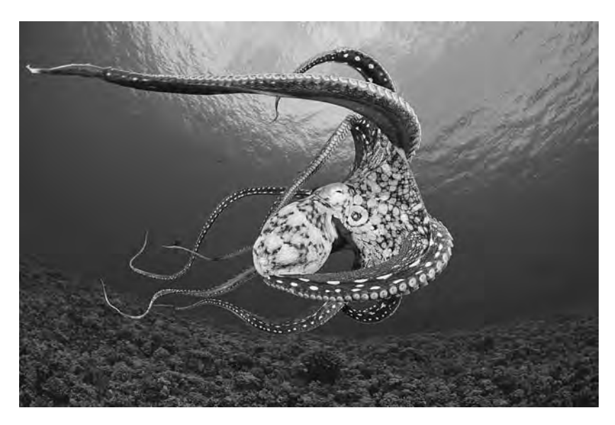
2.7. Day octopus, Octopus cyanea , in the water near Lanai, Hawaii.

ignorance, as they pick up their rucksacks and hike on up to read the newly deciphered lyrics of the lichen on the north face of Pike's Peak."<sup>71</sup>