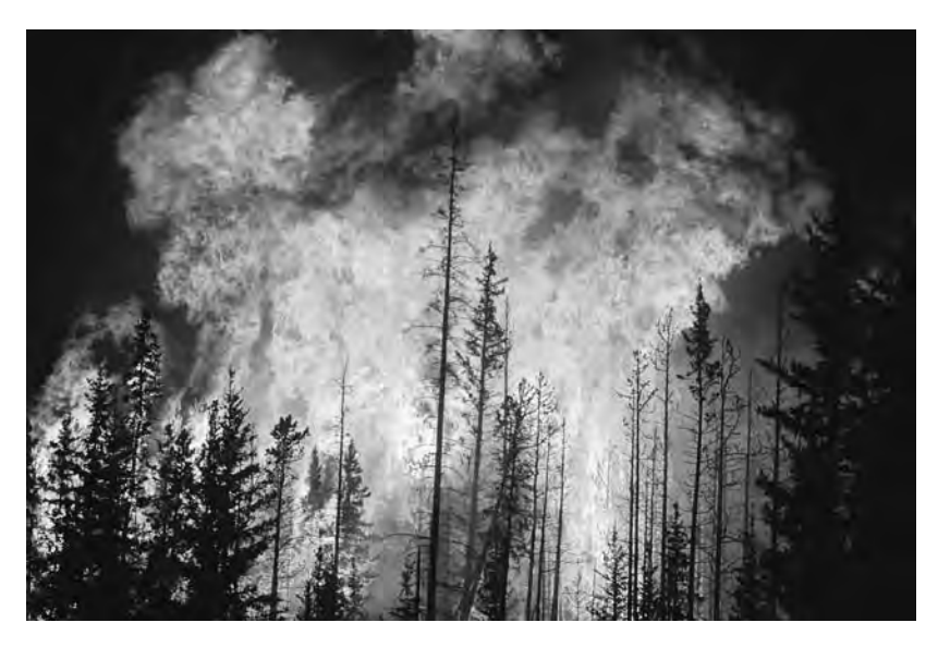
2.3. Icon for the Anthropocene: Flaming Forests. From Rocky Mountain House, Alberta, Canada, June 2, 2009.

which dated from the end of the last ice age, or the end of the Pleistocene, about twelve thousand years ago. Anthropogenic changes signaled by the mid-eighteenth-century steam engine and the planet-changing exploding use of coal were evident in the airs, waters, and rocks. <sup>42</sup> Evidence was mounting that the acidification and warming of the oceans are rapidly decomposing coral reef ecosystems, resulting in huge ghostly white skeletons of bleached and dead or dying coral. That a symbiotic system—coral, with its watery world-making associations of cnidarians and zooanthellae with many other critters too—indicated such a global transformation will come back into our story.