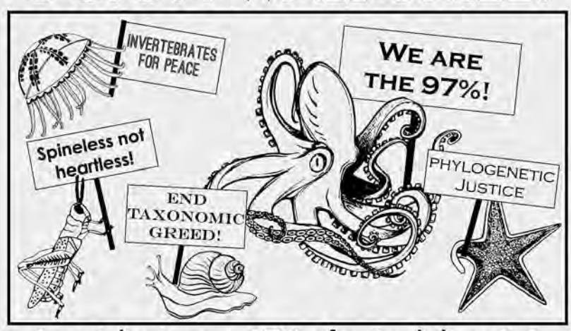
Invertebrates are 97% of animal diversity!

Brought to you by Oregon Institute of Marine Biology, University of Oregon