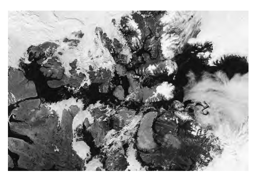
2.4. Icon for the Capitalocene: Sea Ice Clearing from the Northwest Passage, Data 2012.

and stinging jellyfish. Neither did technological determinism produce the Third Carbon Age. Coal and the steam engine did not determine the story, and besides the dates are all wrong, not because one has to go back to the last ice age, but because one has to at least include the great market and commodity reworldings of the long sixteenth and seventeenth centuries of the current era, even if we think (wrongly) that we can remain Euro-centered in thinking about "globalizing" transformations shaping the Capitalocene.<sup>51</sup> One must surely tell of the networks of sugar, precious metals, plantations, indigenous genocides, and slavery, with their labor innovations and relocations and recompositions of critters and things sweeping up both human and nonhuman workers of all kinds. The infectious industrial revolution of England mattered hugely, but it is only one player in planet-transforming, historically situated, new enough, worlding relations. The relocation of peoples, plants, and animals; the leveling of vast forests; and the violent mining of metals preceded the steam engine; but that is not a warrant for wringing one's hands about the perfidy of the Anthropos, or of Species Man, or of Man the Hunter.